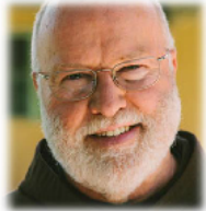
Wisdom of Fr. Richard Rohr [In English]

Time for Stillness & Reflection by Candlelight