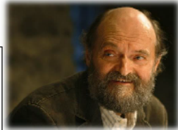
Music of Arvo Pärt